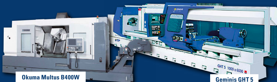
Okuma Multus B400W